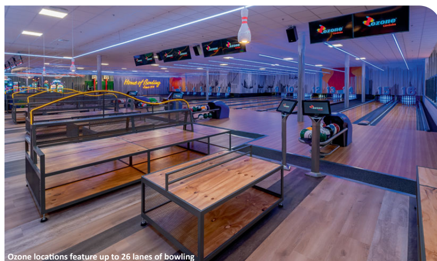
Ozone locations feature up to 26 lanes of bowling

“While bowling as a leisure activity is popular in Spain, Ozone is focused on being a leisure centre for the whole family, from the grandfather who goes with his grandson to teach him how to play, to groups of young teenagers,