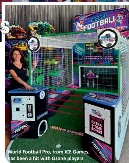
World Football Pro, from ICE Games, has been a hit with Ozone players

This vision means anticipating and meeting the needs of all its stakeholders, both customers and staff.