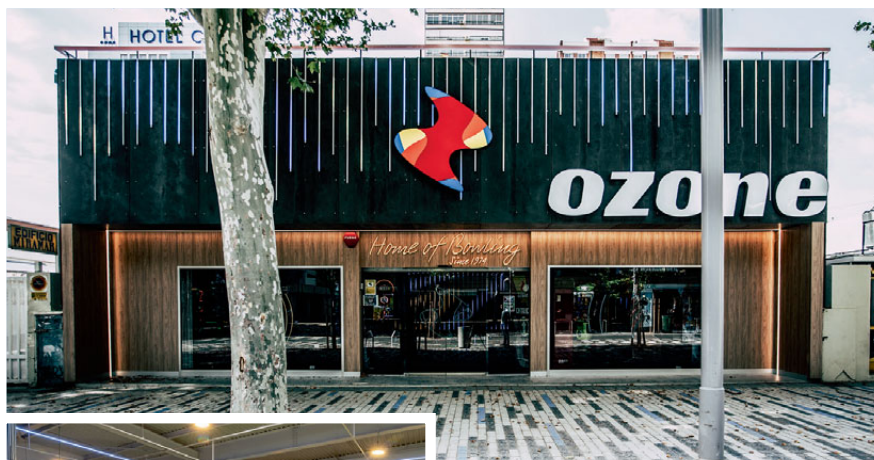
The company recently opened a venue in Benidorm

“In addition, we try to make each centre unique and contribute something different to the brand. That is why some of our centres also have ice rinks, trampoline areas, interactive targets or giant inflatables.