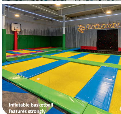
Inflatable basketball features strongly